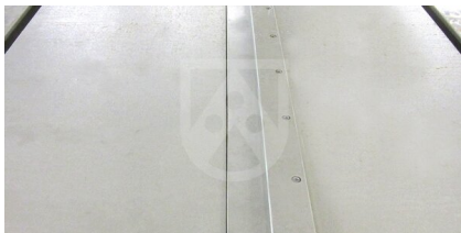
Polystone® P Flex